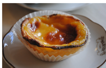
PASTEL DE NATA

4) TAKE A WALK ON THE RUO DE FIGGUEROS. Explore all of the shops and plazas, where everyone hangs out during the day, follow this road up to Liberdade, where you'll find some of the best restaurants. Take your time and walk from square to square (or praca to praca) and people watch as you go.