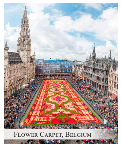
FLOWER CARPET, BELGIUM