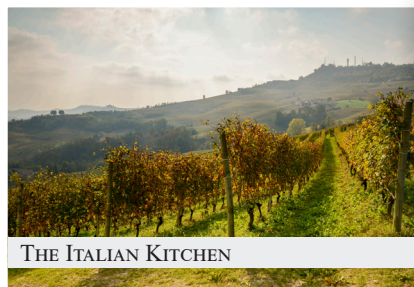
THE ITALIAN KITCHEN