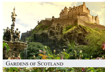
GARDENS OF SCOTLAND