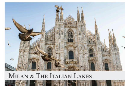
MILAN & THE ITALIAN LAKES