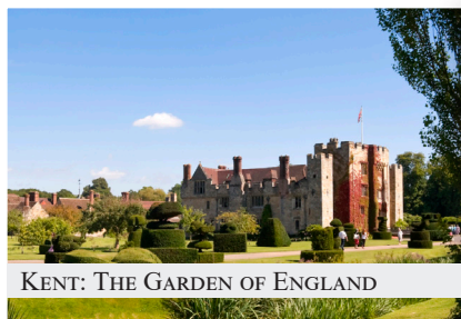
KENT: THE GARDEN OF ENGLAND

TO LEARN MORE ABOUT THESE TRIPS: CALL: (866) 563-7077 ▪ E-MAIL: info@discovereuropeltd.com ▪ VISIT OUR WEBSITE: www.discovereuropeltd.com